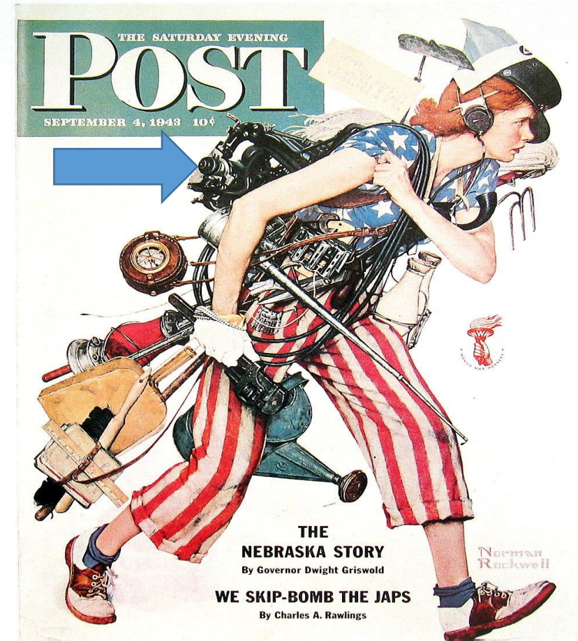
Liberty Girl. Post cover, 4 September 1943.